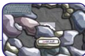
Dig This Activity