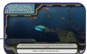
Drone Control Activity

Visit sunburst.com or call 800.321.7511 for more information!